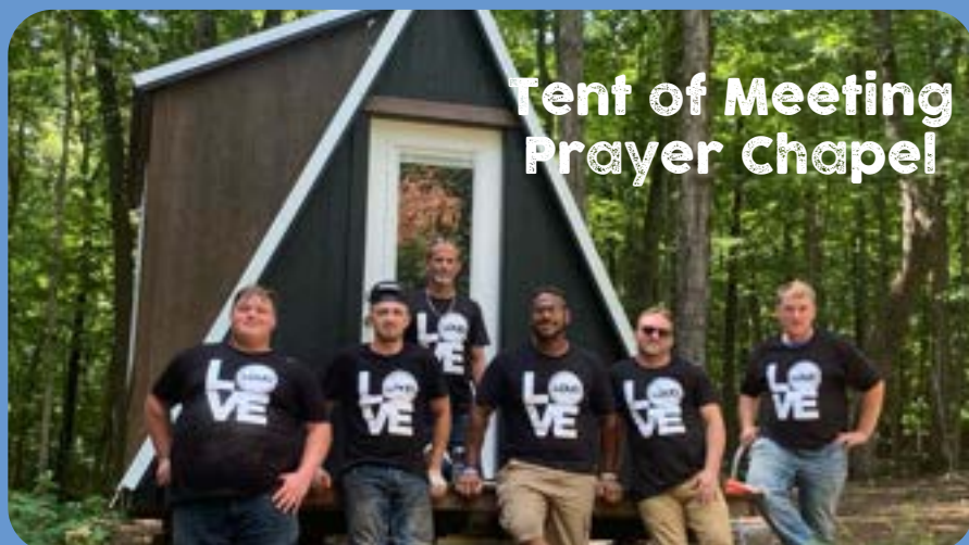
Tent of Meeting Prayer Chapel